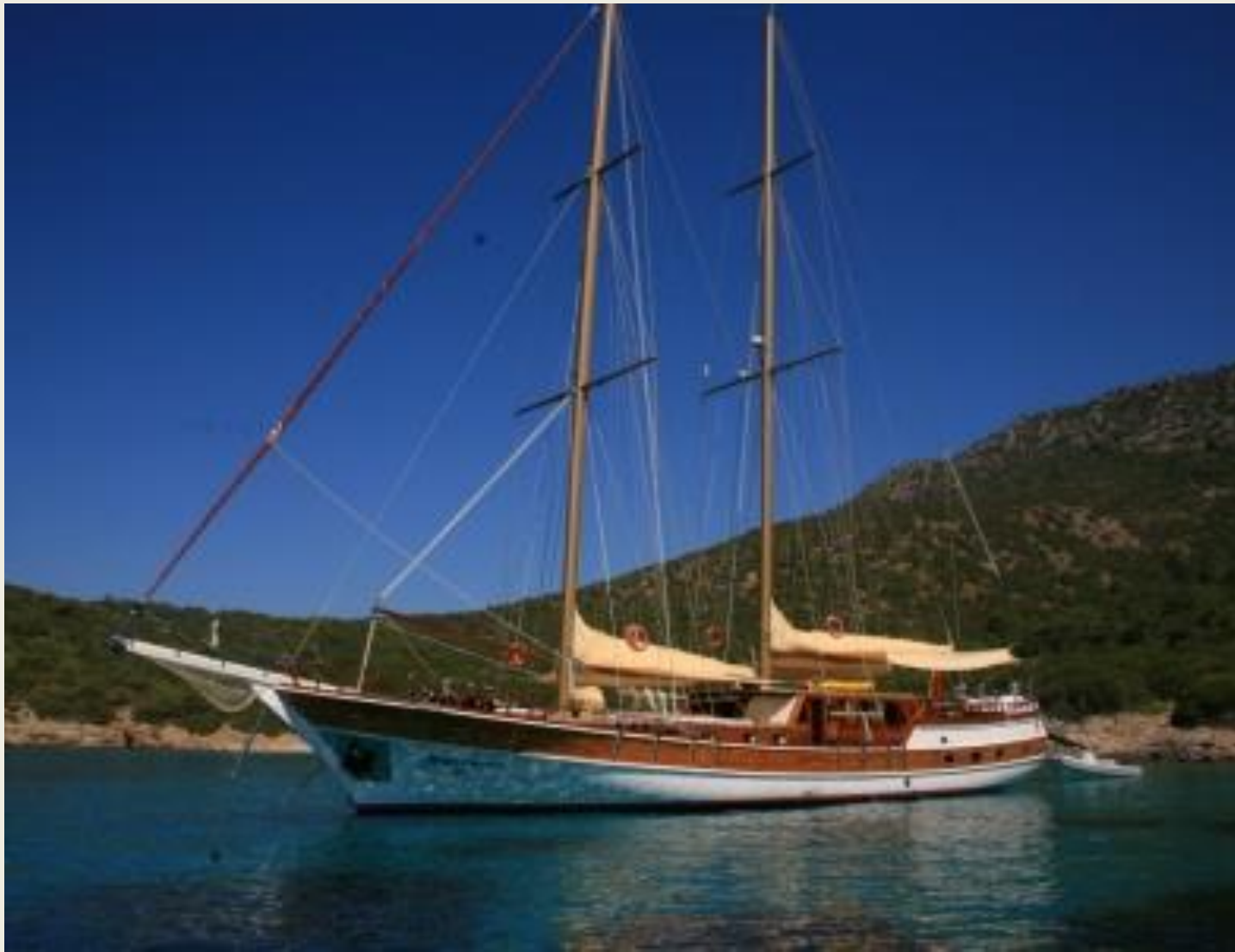
Southern Cross Blue Cruising

The Perfect Charter Gulet for Discerning Groups