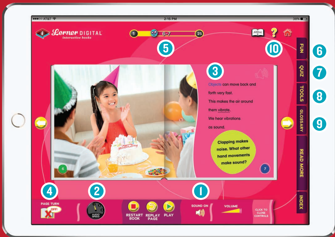
Product shown: Let's Explore Sound from the Bumba Books™ — A First Look at Physical Science series (see page 4).