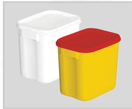
Available in various colours.