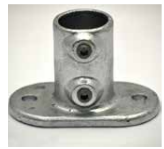
Permanent Mount (multiple choices)