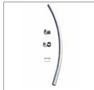
Curved Stanchion Kit