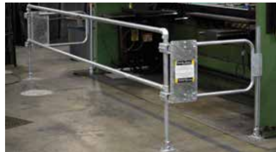
FitRite™ system machine guarding application with self-closing gate.