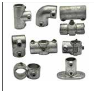
Multiple Fitting Choices