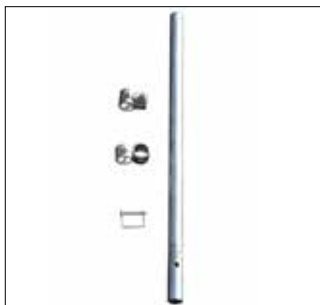
Straight Stanchion Kit