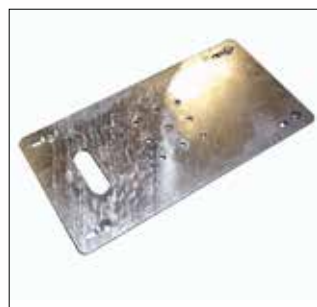
Standing Seam Base (3 sizes)