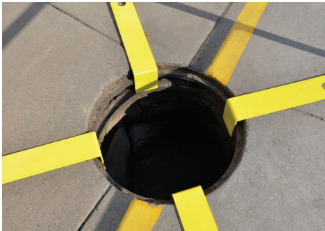
L-shaped legs lock the system into place ensuring OSHA compliance.