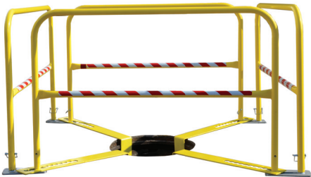
Red and white safety tape for high visibility.