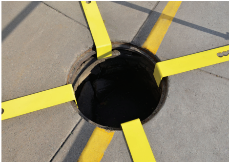
Four leg design for round or square holes.