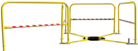
Most popular version features a 58" swing gate