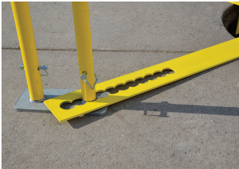
Legs are adjustable to fit a wide range of hole sizes.