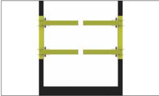
Single gate system