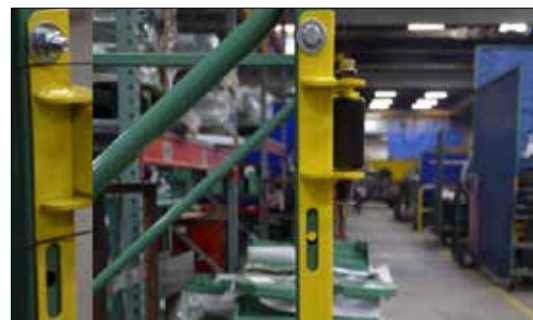
Easy installation of frame assemblies