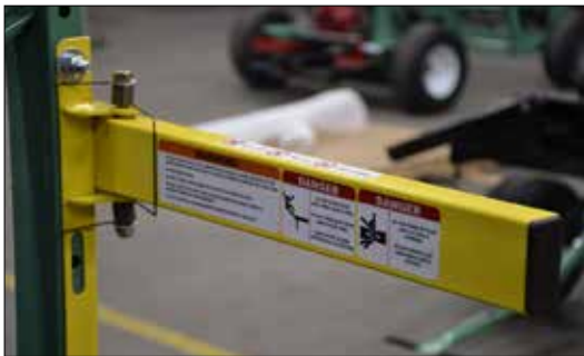
Heavy duty spring loaded arms