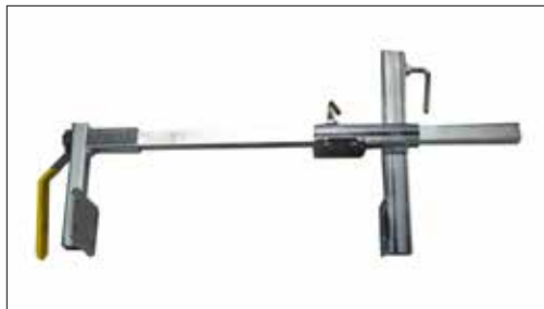
Tool Free Perimeter Clamp