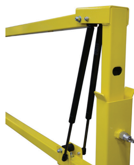
Dual gas struts for near effortless lifting