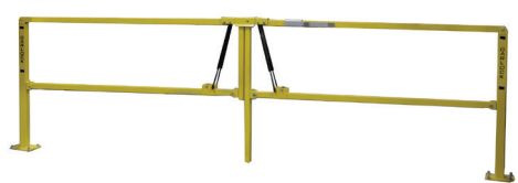
Split gate for very wide openings or low ceiling height