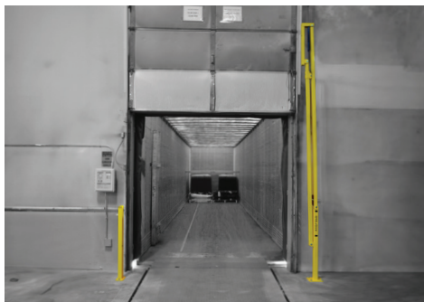
Low ceiling height requirements