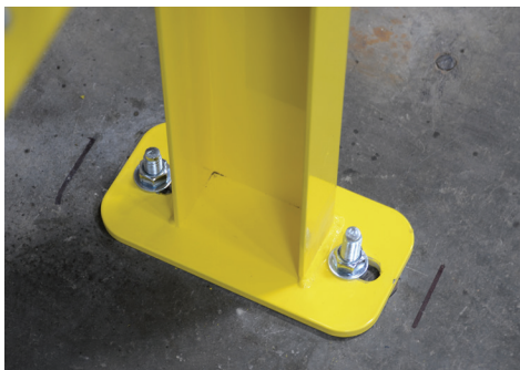
Concrete anchors and all hardware included