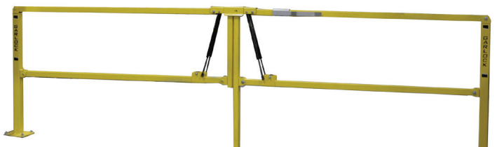
Split opening gates for openings 6 ft. to 14ft. wide