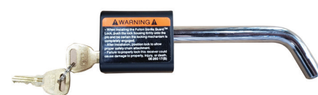
Optional lock for access control