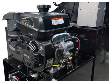
9.5hp Kohler™ Gas Engine