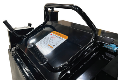
47 Inch Door Loading Height