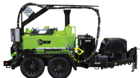
M-Series™ Melter Applicator 150 / 230 / 410 Gallon Units Available