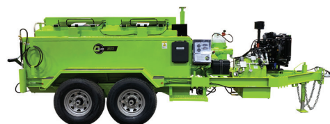
ME3™ Mastic Melter Machine