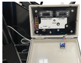
Simple Reliable Control System