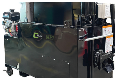
6 Inch Exit Port with Guillotine Valve