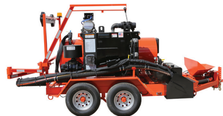
P2™ Two-Person Patcher with DuraPatcher™ Technology