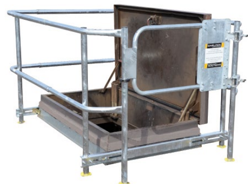
Shown with HatchProtector™