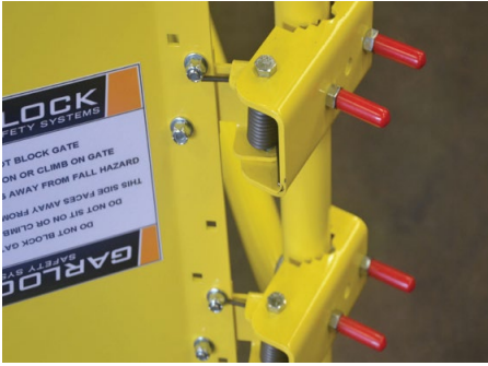
Universal Clamp Mount